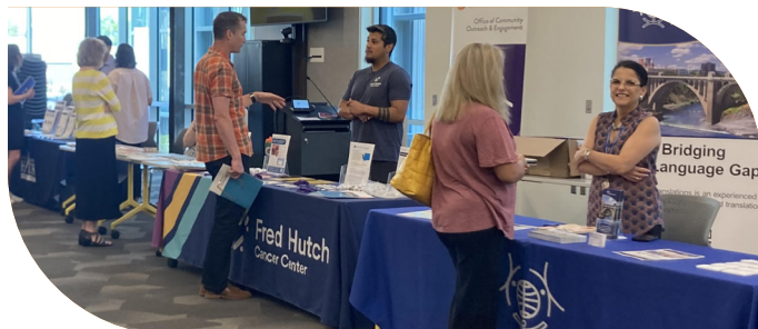
CANEW Resource Event — Spokane WA (July 2024)

Contacto Consulting, LLC , is committed to elevating community voices and centering Black, Indigenous and people of color, immigrants, refugees and other groups whose brilliance has been marginalized because of their race, ethnicity, language, accent, immigration status, disability, economic level, sexual orientation or gender identity. Contacto Consulting has designed and led multiple statewide assessments and strategic planning and implementation processes using a variety of methods, including community conversations, photo-storytelling and interactive priority setting. You can learn more at contactoconsulting.com .