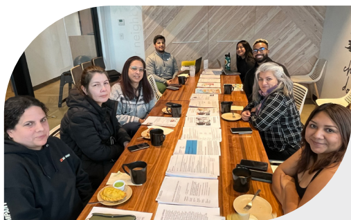
Latinos En Spokane 'Activa Salud' Cancer Session – Spokane WA (February 2024)