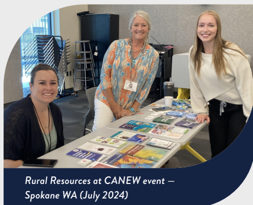
Rural Resources at CANEW event – Spokane WA (July 2024)