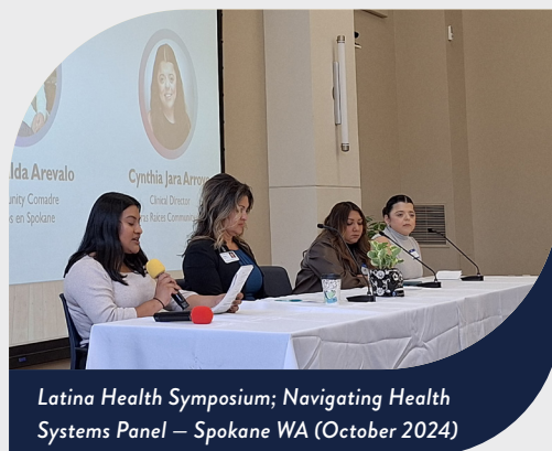
Latina Health Symposium; Navigating Health Systems Panel – Spokane WA (October 2024)