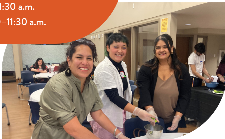
Latina Health Symposium; Cooking with Mely Activity – Spokane WA (October 2024)