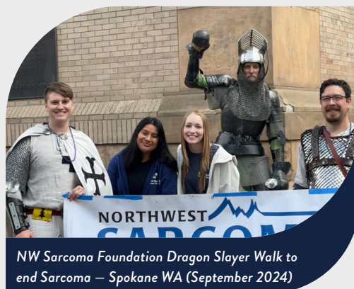
NW Sarcoma Foundation Dragon Slayer Walk to end Sarcoma – Spokane WA (September 2024)