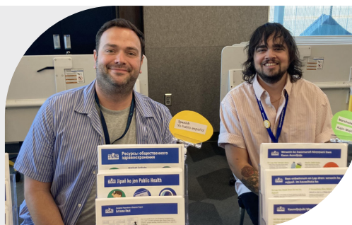
SRHD Health Equity Team at CANEW event – Spokane WA (July 2024)