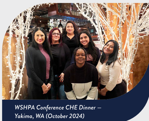
WSHPA Conference CHE Dinner – Yakima, WA (October 2024)