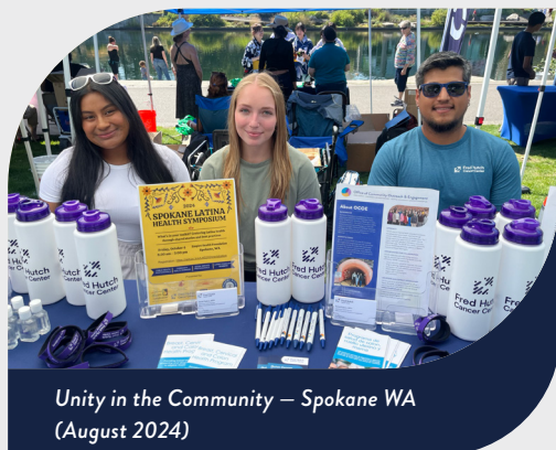
Unity in the Community – Spokane WA (August 2024)