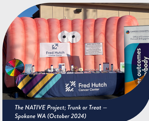
The NATIVE Project; Trunk or Treat – Spokane WA (October 2024)