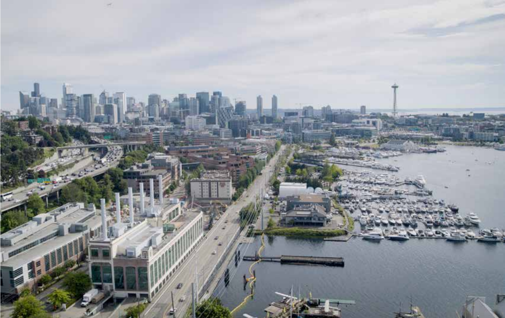
Seattle's Fred Hutch 15-acre campus on South Lake Union.