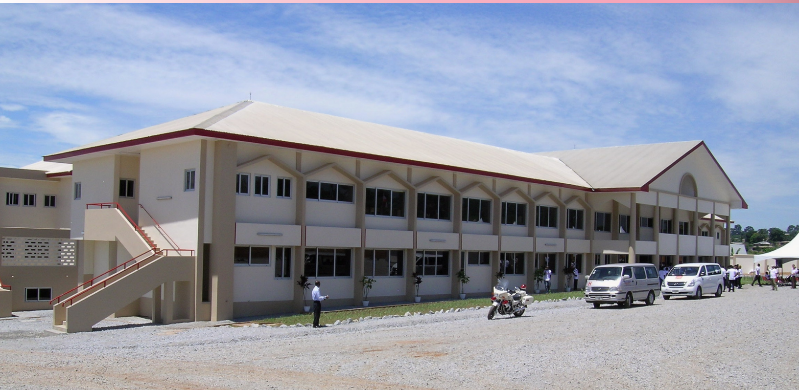
HopeXchange Medical Center in Kumasi, Ghana, site of the first BHGI Learning Laboratory