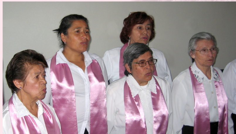
A choir of breast cancer survivors in Bogotá

In recognition of the importance of international collaborative partnerships, Susan G. Komen for the Cure is funding specific activities that support the development of the Ghana Breast Cancer Alliance (GBCA) Program and establishment of the first BHGI Learning Laboratory (LL) in Kumasi, Ghana. (Full details on the GBCA and the BHGI LL are outlined on pages 3-5.)